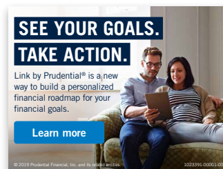
Online Banners Available in multiple sizes: 400x300, 250x280, 970x250, 300x600